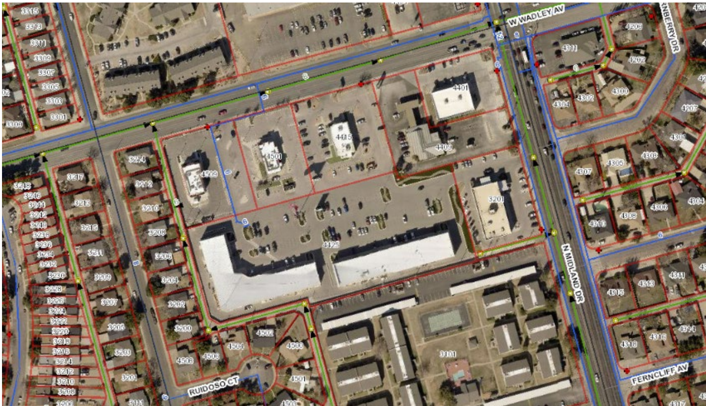
Texas Pride Shopping Center