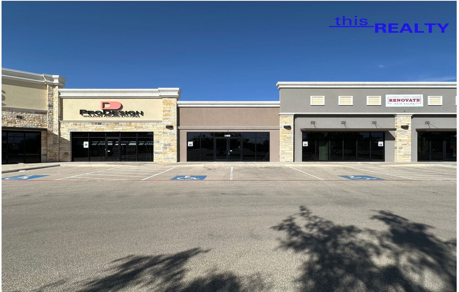
Texas Pride Shopping Center