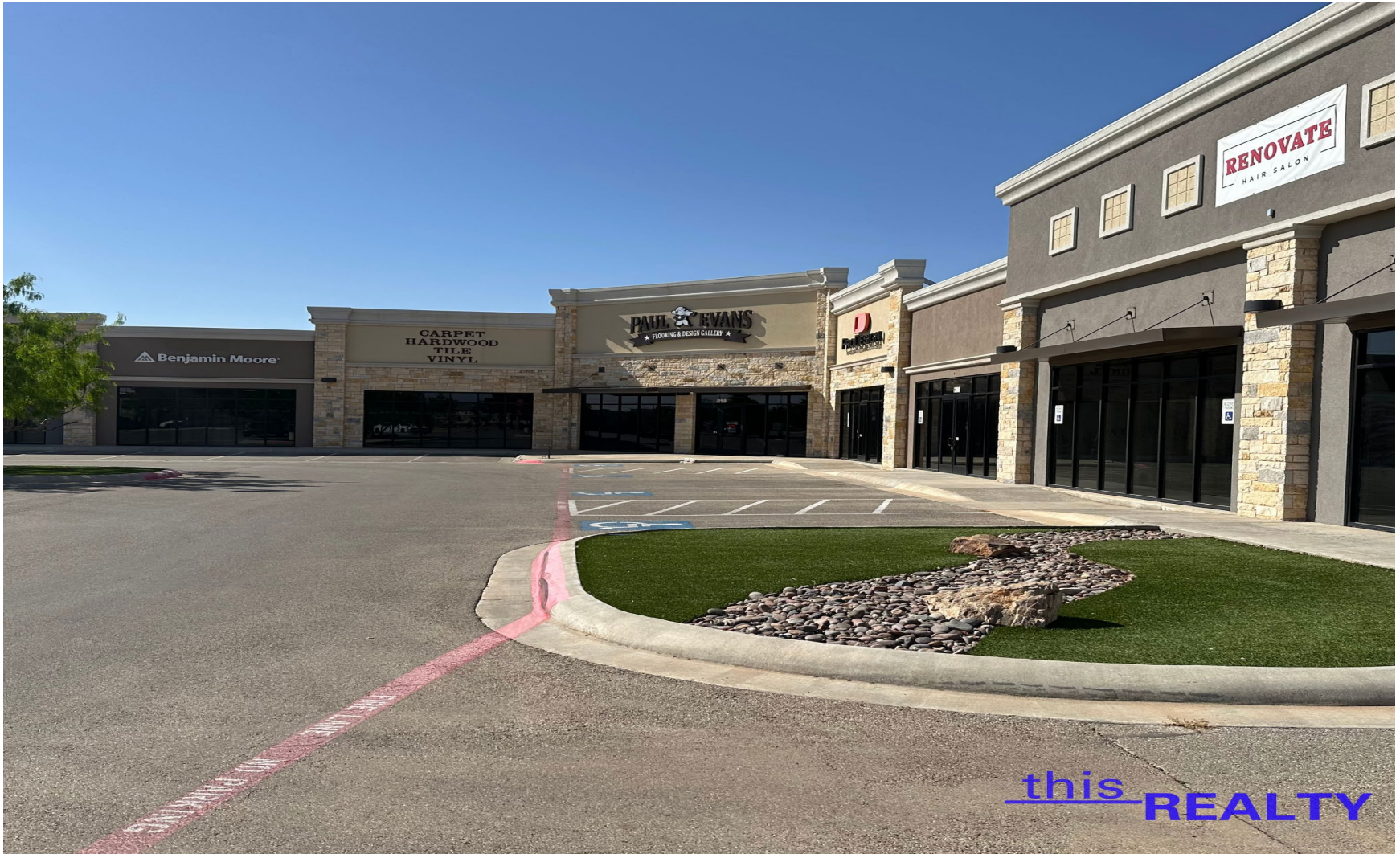
Texas Pride Shopping Center